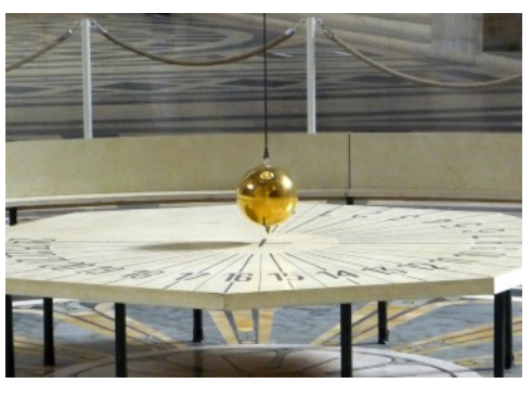
Foucault Pendulum - understood to be proof for a spinning earth.

In none of these models would the universe fly apart, nor would a stationary satellite fall to earth. In every one of these models the astronauts on the moon would still see all sides of the earth in the course of 24 hours, the Foucault pendulum would still swing exactly the same way as we see it in museums, and the earth's equator would still bulge.